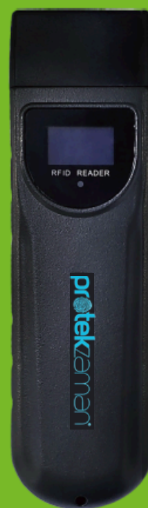
P30 Patrol stick X00610003