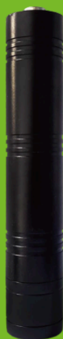
P10 Patrol stick X00610001