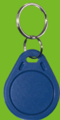
ID Card X00101005