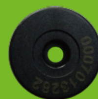
Location tag X00602015