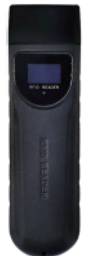
P30 Patrol stick