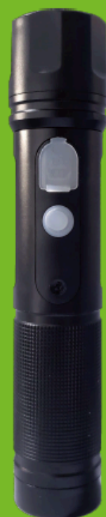
P20 Patrol stick X00610002