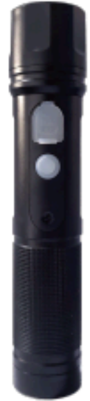
P20 Patrol stick