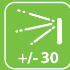
Wide Pose Angle Acceptance