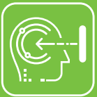
Proactive Facial Recognition