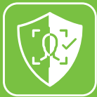
New Height of Anti-Spoofing