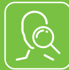
Touchless for Better Hygiene